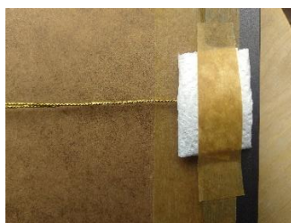
2. PADDED D RING