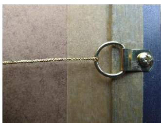
1. D RING

If you would like advice about framing, please contact any member of the Exhibition Team who will be happy to help you.